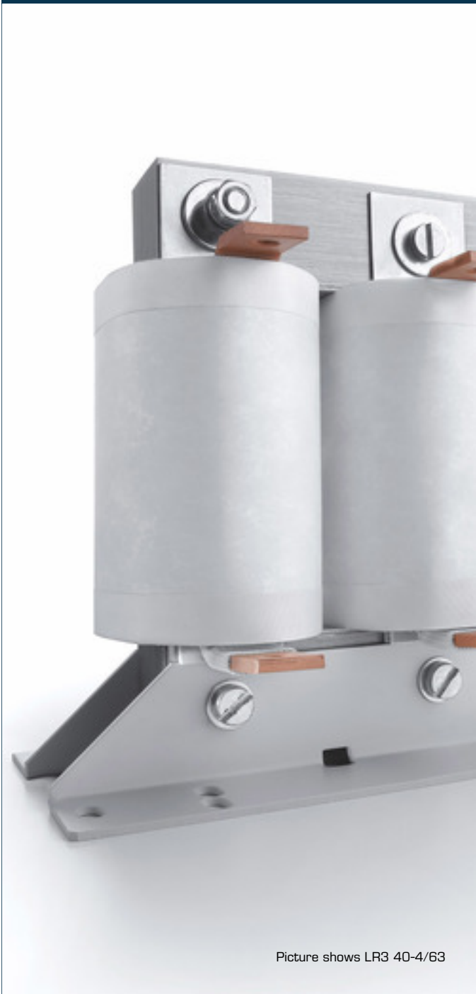
Picture shows LR3 40-4/63